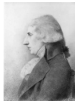
Attempts by reformers like Pushkin and Lermontov to influence the policies of Tsar Nicholas I (left), challenged the worst oligarchical elements of Imperial Russia, represented by Russian Minister of Foreign Affairs Count Karl Robert Nesselrode (center left). Nesselrode's views were shaped by the 1815 Congress of Vienna, and its Habsburg and British Empire spokesmen Prince Klemens Metternich (center right) and Viscount Castlereagh (right).