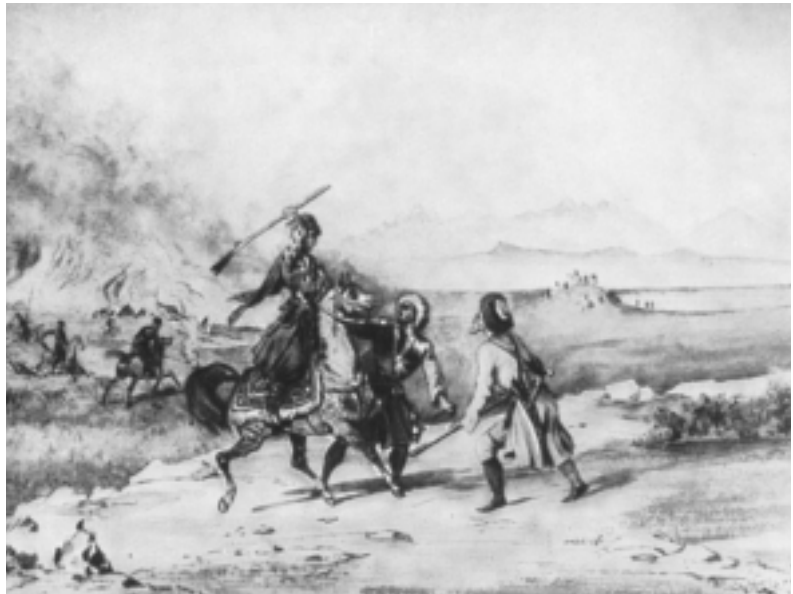
Episode from the Caucasian War, watercolor by M. Lermontov and G.G. Gagarin.

“The Hero of Our Time is certainly a portrait,” explains Lermontov, “but not of a single person. It is a portrait of the vices of our whole generation in their ultimate development. You will say that no man can be so bad, and I will ask you why, after accepting all the villains of tragedy and romance, you refuse to believe in