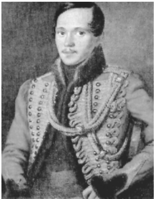
Mikhail Yurievich Lermontov