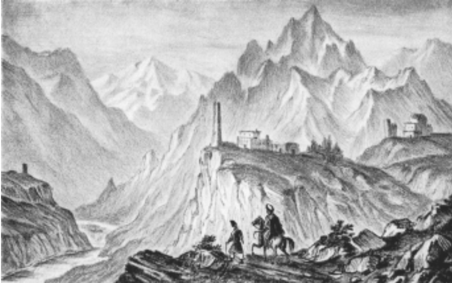
View of Mt. Kreshora from the gorge near Kobi, the Caucasus. Drawing by M. Lermontov.

ization and change after the defeat of Napoleon in 1815.